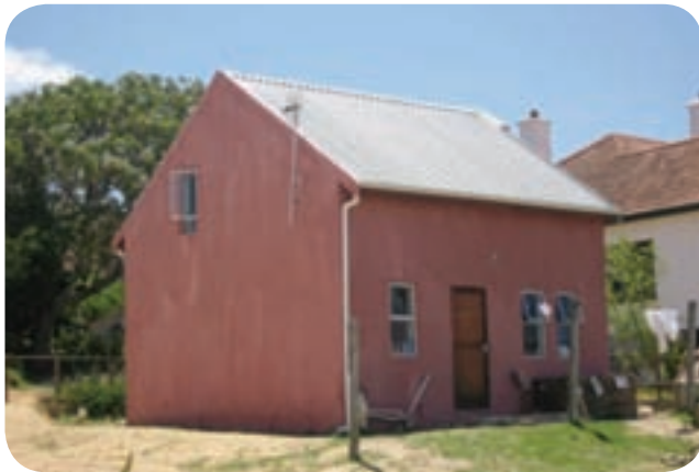
Hydraform brick house, Lynedoch Ecovillage, Stellenbosch

Hydraform bricks are manufactured by hydraulically compressing a soil-cement mixture in a block-making machine. Hydraform in Gauteng sells a range of machines, from a hand-held to sophisticated hydraulic machines for block yards. Hydraform bricks can be manufactured on site and dry-stacked, reducing the embodied transport and curing energy significantly to around 0.635 MJ/kg. The product contains a small percentage of cement which largely accounts for its embodied energy component. Hydraform also has a block yard producing over 2 million bricks per year that comply with SA national building regulation requirements for strength, durability and stability.