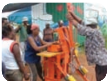
Pressing the earth blocks