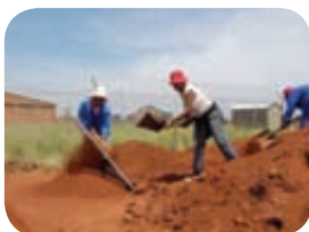
Sieving the local soil