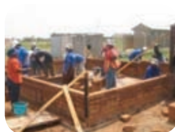
Training on building with CSEBs and local earth mortar