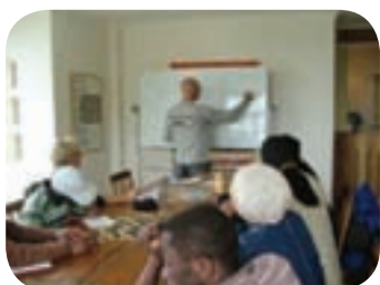
Training given to community members

The Simunye Project won the Canadian International Cooperation Prix d' Excellence Africa 2007 Award for demonstrating a more socially transformative and environmentally sensitive approach to community development that furthered entrepreneurial opportunities for women in Africa. It was also one of 15 finalists for the International Institute for Sustainable Development and UNDP 2008 SEED Award ( www.seedinit.org ).