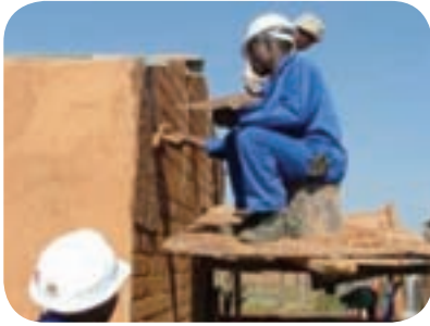
Plastering with local earth plaster (natural colour of local soil)