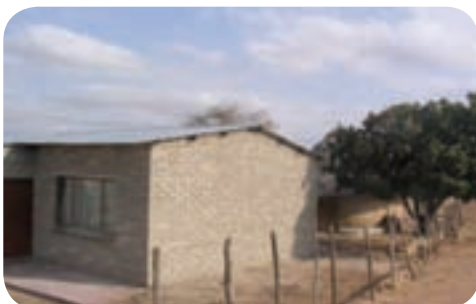
50 m 2 compressed sand-and-cement brick house.

River sand, stone and cement are mixed and concrete bricks manufactured on site. Two wheelbarrows of sand and stone are mixed with 25 kg of cement and a bucket of water in a Pan Mixer. This is then poured into a hydraulic press that produces compressed sand bricks. The facility is 5 km from a rural village where 115 low-cost houses were constructed. The brickyard employs 32 local people. The sand is sourced and carried by donkey carts and tractor-drawn trailers from a river bed 2 km away. The bricks are solar dried in the hot bushveld sun.