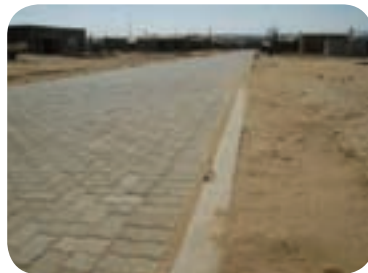
The finished road, surfaced with 60mm pavers made by a community-operated brickyard.