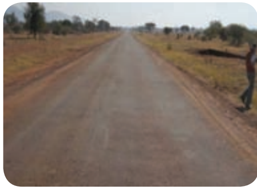
The Otta seal-surfaced road, still in good condition three years later