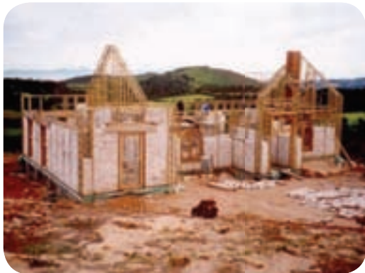
An eco-beam sandbag house under construction

Earthbag construction has recently become a popular natural building technique. Sandbags have long been used by the military to create bunkers and other structures. They are literally dirt cheap, as they use local sand and low-cost polypropylene or geo-fabric bags. The technique is ideal in sandy areas such as the Cape Flats. No bricks or concrete blocks have to be moved, which means there is no energy embodied in transport.