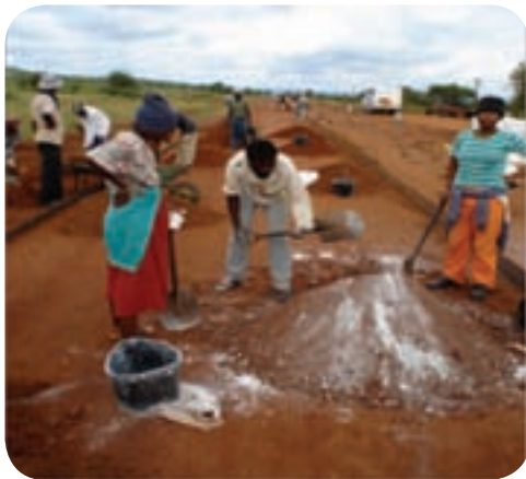
Mixing the stabilizer with the in situ soil

The AnyWay trial section used in situ soil next to the roadway, which provided soil for road layers as well as creating a drain to remove rainwater from the road. Only manual labour, hand tools, steel shutters and a walk-behind compacting roller were used. Following stabilization, the road was left un-surfaced for 1 year and then surfaced with an Otta seal.