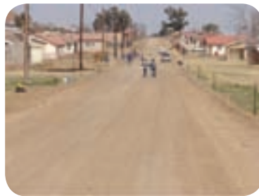
The road after stabilization and compaction, providing a safe, all-weather driving