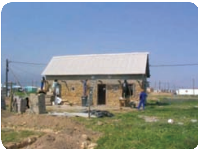
The 'Stonehouse' in Mbekweni under construction, with Cape Brick masonry in the foreground

Building rubble was used in the foundation trenches to enhance thermal mass. An insulated ceiling was installed using recycled carpet under-felt, and the ceiling consists of industrial wood pallets. The window frames were constructed from local wood off-cuts, with recycled glazing.