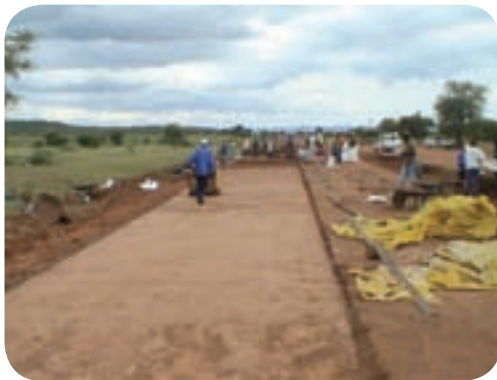
Compacting with walk-behind roller