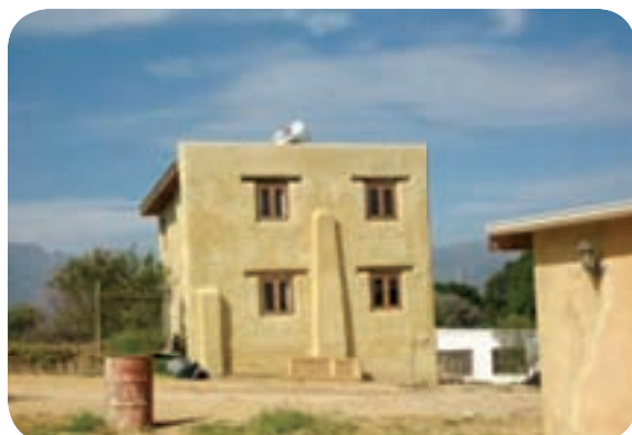
Adobe can be used to build a luxury double-story house as can be seen at the Lynedoch Ecovillage