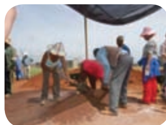
Mixing soil and stabilizer and adding water