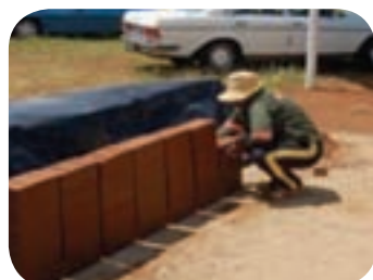
Stacking blocks for humid curing