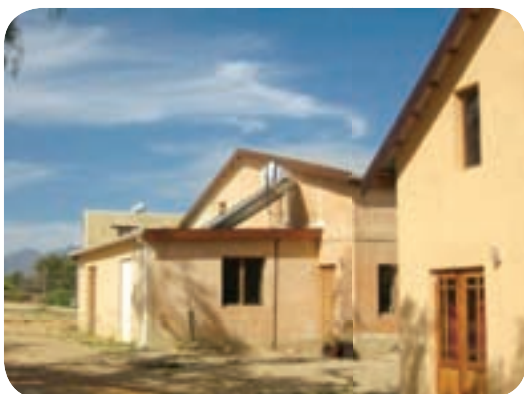
Adobe brick homes, Lynedoch Ecovillage

However, insulation is only really necessary in the colder climate regions of Northern Europe and America. (Roaf, S et al. 2003). In South Africa's low cost housing sector the only issue is to provide ceilings with proper insulation in order to reduce the thermal comfort of tin-roofed matchbox RDP houses (The envelope effect).