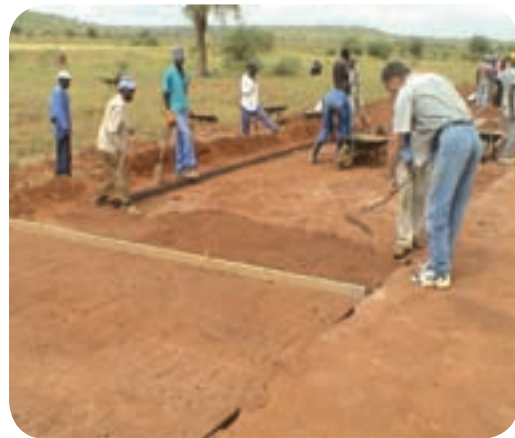
Shaping the stabilized layer