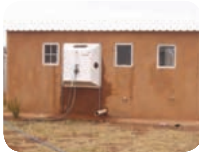
SABS rainwater penetration testing