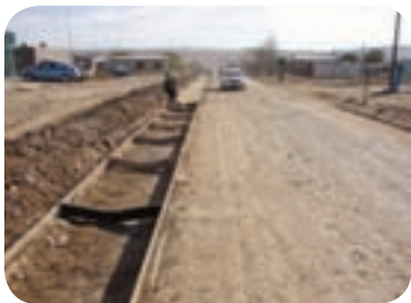
Constructing the side-drain next to the stabilized road