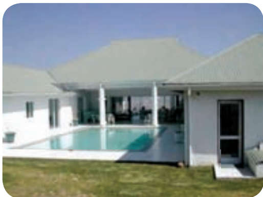
Sandbag structures are strong and can even build mansions

Eco Beam Technologies in Epping developed a sandbag home building kit and a process consisting of three steps. A structure is erected using eco-beams/lattice beams made of two wooden struts connected with zig-zagged aluminium strips to provide rigidity and strength. The frame is then filled in with sand bags to form the walls. The bags rest on each other and are not cemented together like concrete blocks. Plumbing and wiring are routed through the timber uprights. The sandbag walls are then covered with chicken mesh wire, dampened and plastered. Sandbag walls cannot crack, are fireproof, good insulators and resist water penetration.