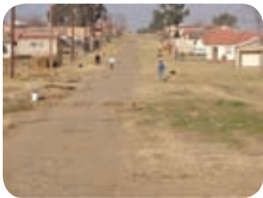
Original township road