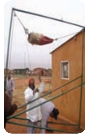
SABS soft body impact testing